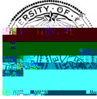
THE UNIVERSITY OF CALIFORNIA